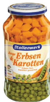
Peas with Carrots (Erbsen und Karotten) 660g