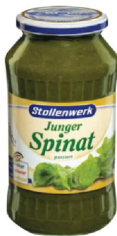
Sieved Spinach (Junger Spinat) 650g