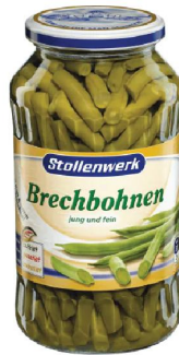
Breaking Beans (Brechbohnen) 660g