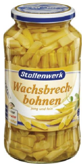
Wax Beans (Wachsbrechbohnen) 660g