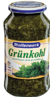
Green Cabbage (Grünkohl) 660g